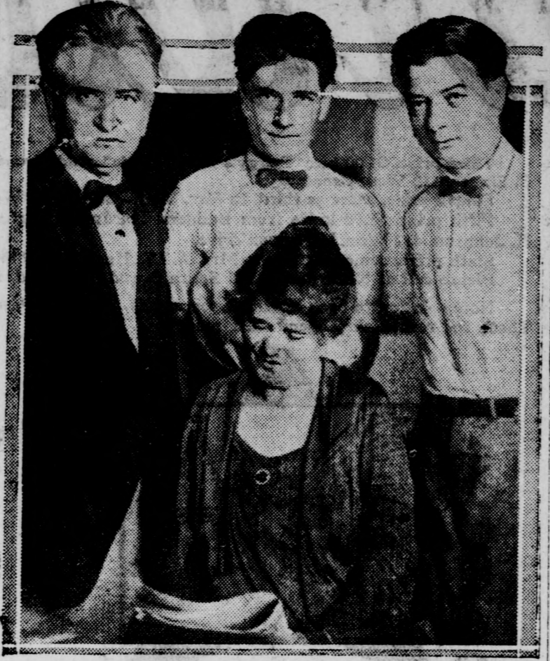
Senator Robert M. La Follette of Wisconsin has won the re-nomination for the senate and is assured of strong support in the regular elections in November.